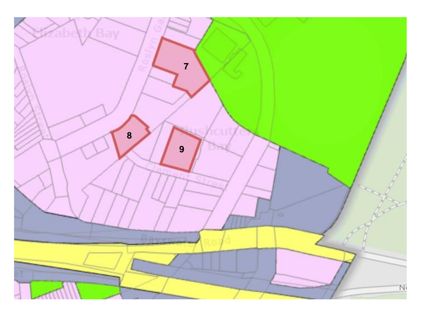
Figure 15. Extract from SLEP 2012 Zoning map showing controls for 50-58 Roslyn Gardens, Rushcutters Bay (7), 74-76 Roslyn Gardens, Rushcutters Bay (8) and 1-5 Clement Street, Rushcutters Bay (9).