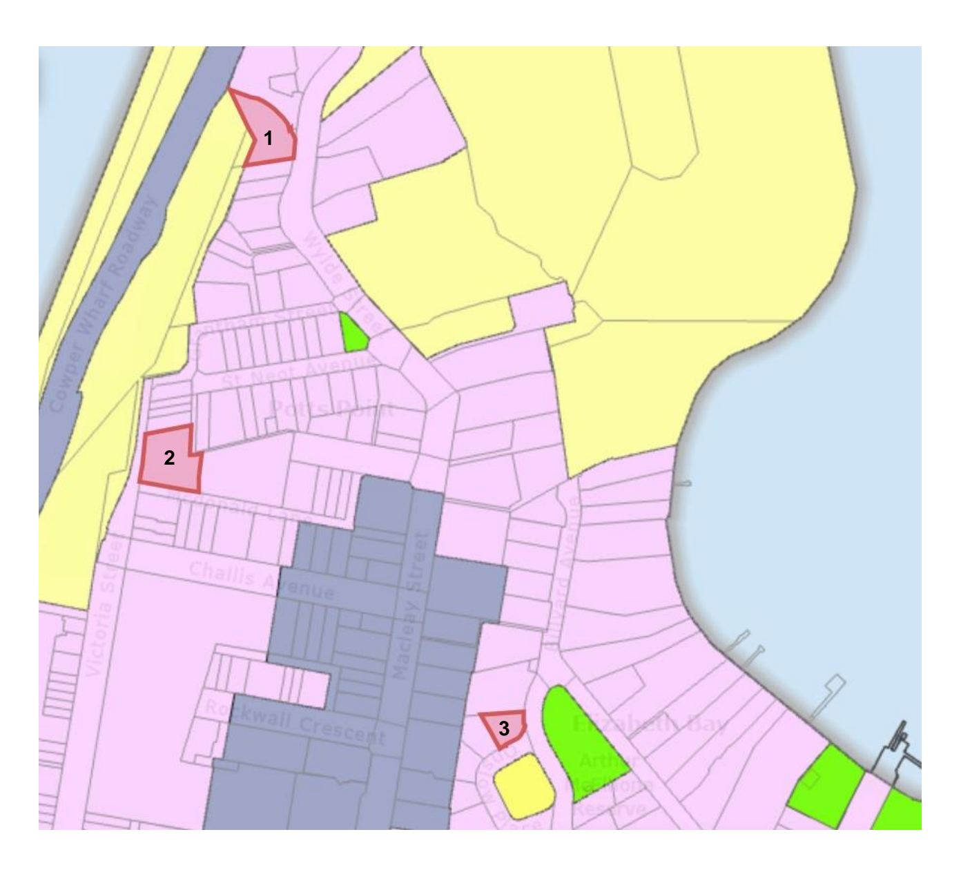
Figure 13. Extract from Zoning map in the SLEP 2012 showing zoning controls for 3 Wylde Street, Potts Point (1), 40-44 Victoria Street, Potts Point (2) and 5 Onslow Avenue, Elizabeth Bay (3).

The nine proposed heritage items occupy land zoned R1 – General Residential. Three of the buildings – no. 108 Elizabeth Bay Road, no. 50-58 Roslyn Gardens, Rushcutters Bay and no. 41-49 Roslyn Gardens, Elizabeth Bay – are abutted by land zoned RE1, Public Recreation. No. 41-49 Roslyn Gardens, Elizabeth Bay is also abutted by land zoned MU1 – Mixed Use.