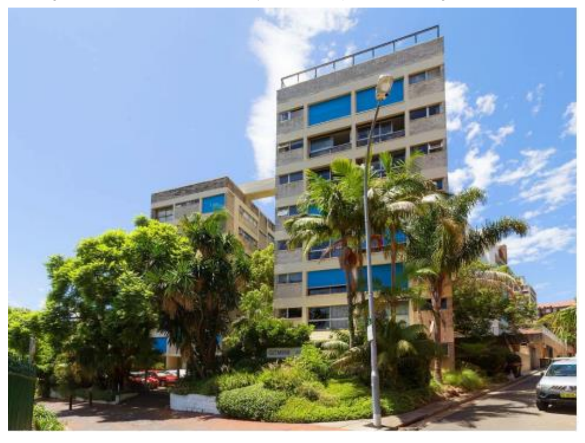
Figure 5. Gemini.

40 Victoria Street: Features symmetrical façades with full-height windows, a polished stone lobby, and studios arranged around a central core. While 42–44 Victoria Street is a larger block with four vertical rows of windows, a ground floor lobby, and amenities like a roof garden and pool. The two buildings are connected at roof level by a concrete pedestrian bridge.