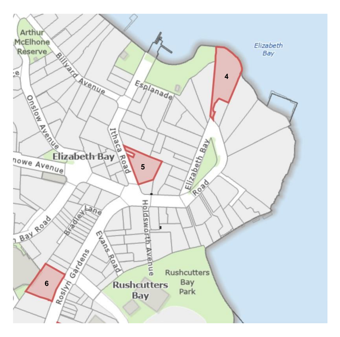
Figure 2. Location of 108 Elizabeth Bay Road, Elizabeth Bay (4), 12 Ithaca Road, Elizabeth Bay (5) and 41-49 Roslyn Gardens, Elizabeth Bay (6).