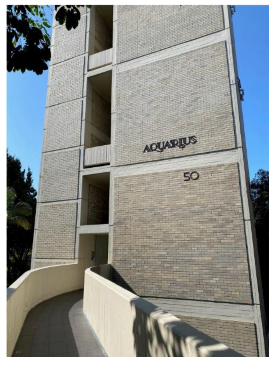
Figure 10. Aquarius.

Aquarius is a 10-storey apartment building designed by Harry Seidler and Associates and constructed by James Wallace (1965). It features 60 studio and 20 one-bedroom units. The apartments offer views of Rushcutters Bay and Sydney Harbour. The design includes a slender tower-like core and a distinctive southern façade with cantilevered bedrooms. Built with a reinforced concrete frame and blonde-face brick, the layout is efficient.