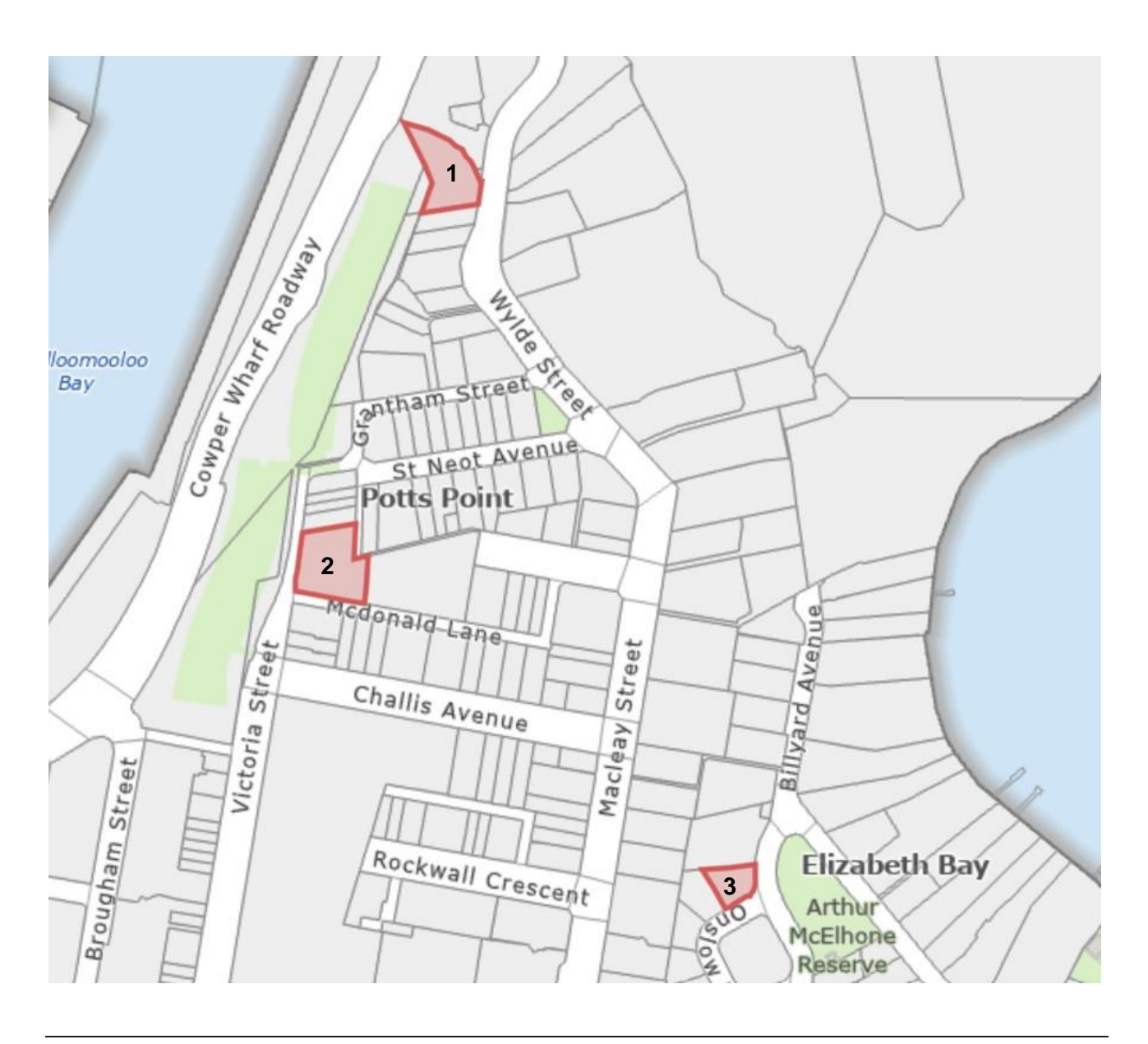
Figure 1. Location of 3 Wylde Street, Potts Point (1), 40-44 Victoria Street, Potts Point (2) and 5 Onslow Avenue, Elizabeth Bay (3).

The relevant structures subject to this planning proposal are outlined in red in Figures 1-3.