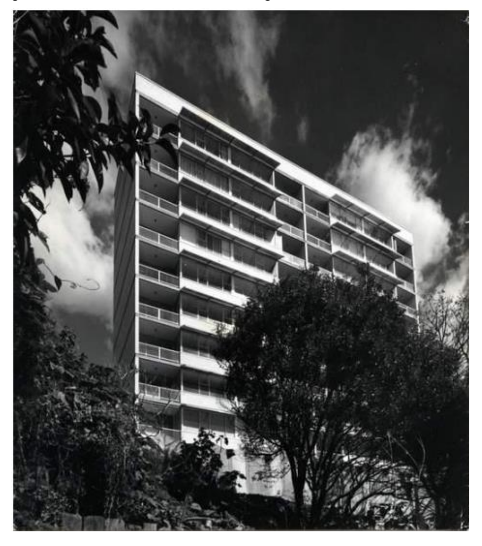
Figure 8. Ithaca Gardens. Max Dupain, 1959.

Ithaca Gardens is a 10-storey building with 40 two-bedroom units built to the design by Harry Seidler and Associates by builders Civil and Civic Contractors (1960). It was designed to maximize views to the northeast. It features minimal landscaping, projecting open galleries linking the fire stairs and lifts on every second floor, and an undercroft park with a prominent glass entrance lobby. A cantilevered roof over the carpark allows for a column-free space. The northern elevation includes recessed balconies and ribbon windows with projecting sun awnings. Each unit has generous external windows for natural light and ventilation.