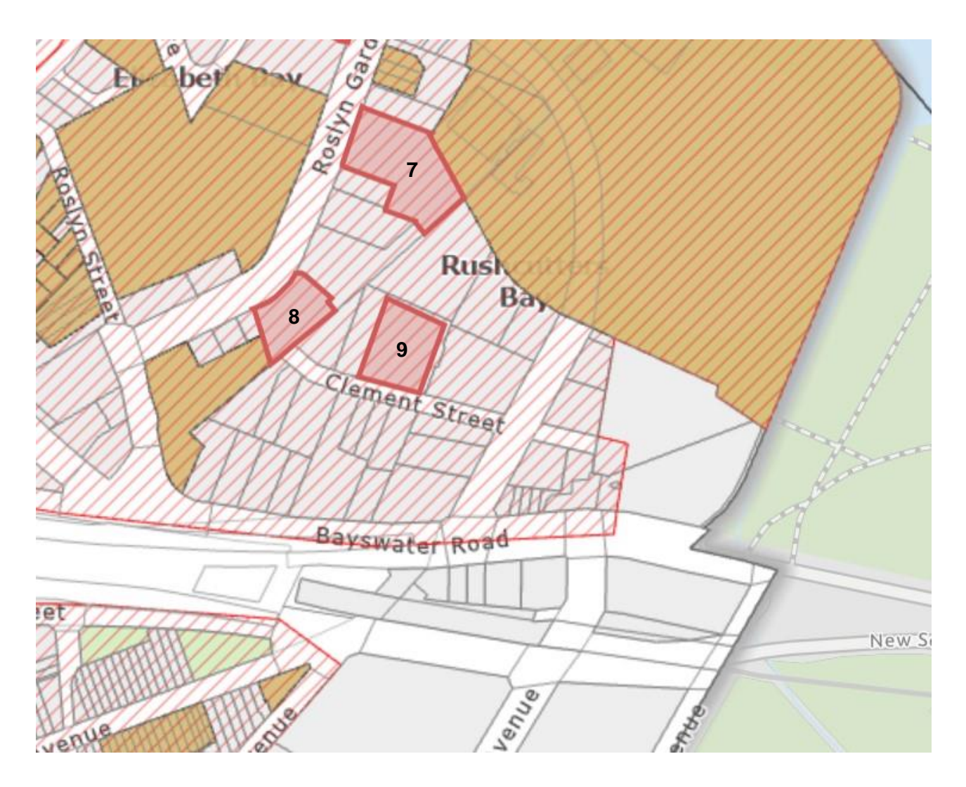
Figure 18. Extract from the SLEP 2012 Heritage Map (HER_022) showing heritage items 50-58 Roslyn Gardens, Rushcutters Bay (7), 74-76 Roslyn Gardens, Rushcutters Bay (8) and 1-5 Clement Street, Rushcutters Bay (9).