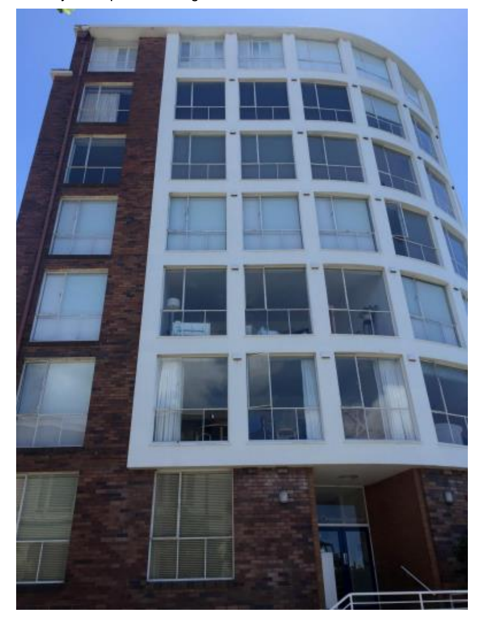
Figure 6. St Ursula.

St Ursula is a seven to eight-storey building designed by Hugo Stossel and constructed by RH Andrews and Co (1951-1953) at Onslow Avenue and Onslow Place, opposite Elizabeth Bay House. It features a curved front, reinforced concrete and brick construction, and large southeast windows. Each floor has two two-bedroom apartments, totalling 13 units plus a penthouse with a terrace. Ground and basement levels include garages and storage. The layout ensures good amenity with spacious living areas and main bedrooms.