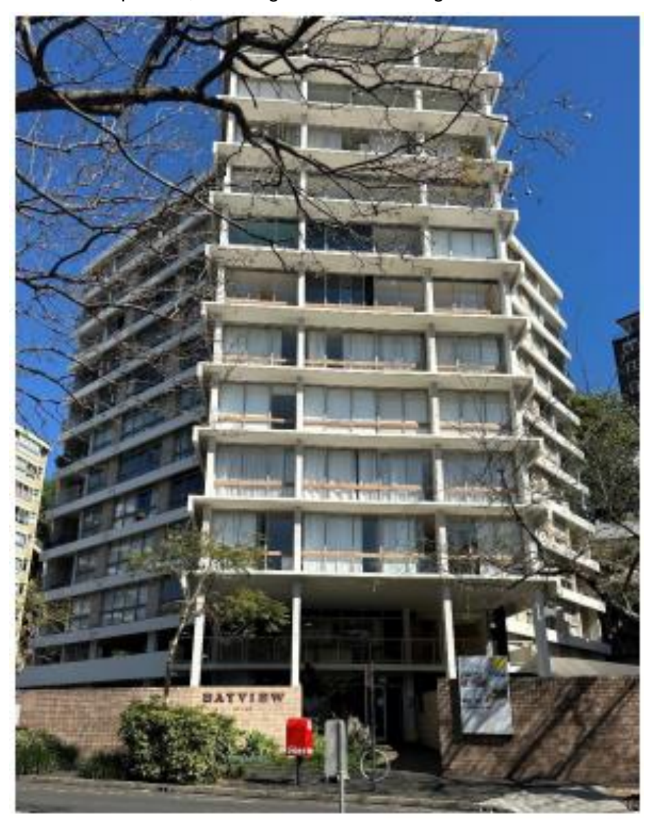
Figure 9. Bayview.

The Bayview is a 12-storey building with 80 units arranged in a Y formation. It was designed by Hugo Stossel and Associates and constructed by Parkes Development (1966-68) and features a reinforced concrete frame, full-height glazing, and recessed balconies. The ground floor includes the original lobby and car park, while upper floors originally housed seven single-bedroom and one two-bedroom unit per level. The design promotes natural light and ventilation, with some original interiors still present, including vermiculite ceilings.