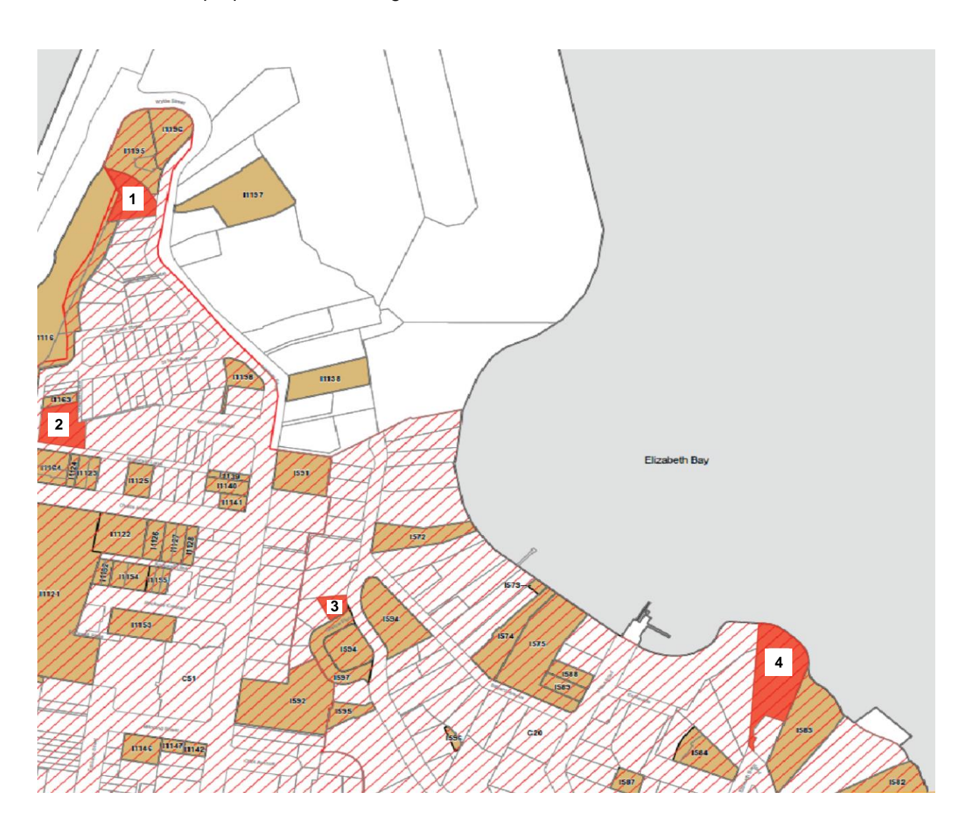
Figure 19. Proposed heritage boundary for 3 Wylde Street, Potts Point (1), 40-44 Victoria Street, Potts Point (2), 5 Onslow Avenue, Elizabeth Bay (3) and 108 Elizabeth Bay Road, Elizabeth Bay (4), shaded in red on the SLEP 2012 Heritage Map tile HER_021.

The Heritage Map tile HER_021 and HER_022 will be updated to shade in brown the location of the nine new heritage items. The heritage map extract in Figure 19 and Figure 20 shows the boundaries of the proposed new heritage items.