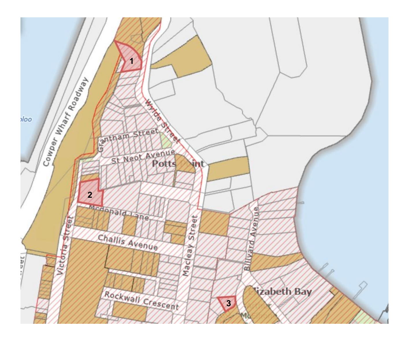
Figure 16. Extract from the SLEP 2012 Heritage Map (HER_021) showing heritage items adjacent to 3 Wylde Street, Potts Point (1), 40-44 Victoria Street, Potts Point (2) and 5 Onslow Avenue, Elizabeth Bay (3).