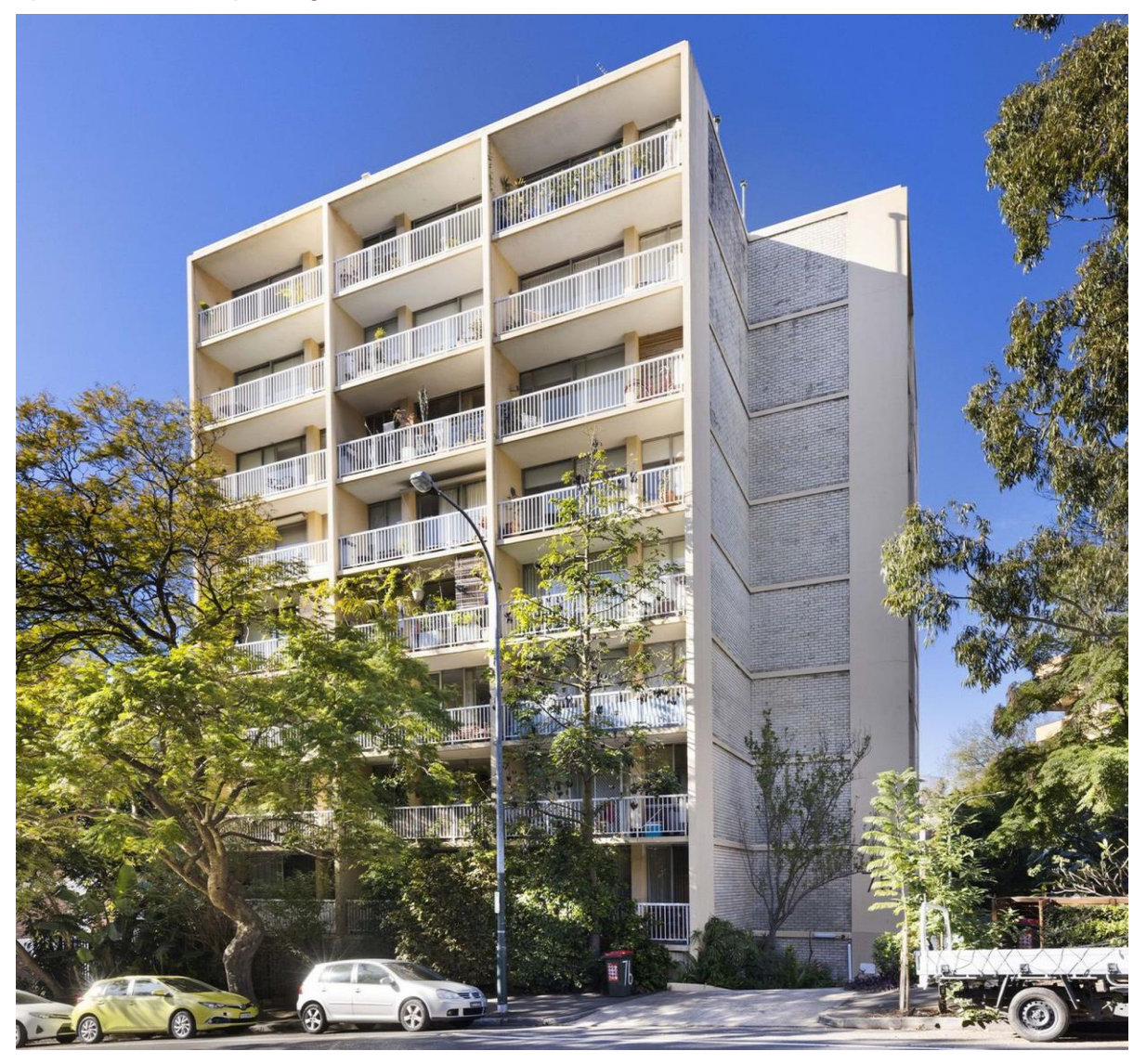
Figure 11. Roslyn Gardens.

Roslyn Gardens is a nine-storey cream brick and reinforced concrete residential flat building containing 64 studio apartments designed by Douglas B Snelling and built in 1964. The building is orientated northwest and southeast, in response to the alignment of Roslyn Gardens. Concrete ramps for vehicles are located on both sides of the lot that lead from Roslyn Gardens, at the western side to the ground floor and pedestrian entry, and to the northeast down to the underground basement carparking. The site connects to Clement Street at the rear with an entry gate and ramp down to the basement carparking. A large reinforced concrete retaining wall forms the rear boundary to the property to the southeast. The wall contains paired zigzag forms with open vents to the parking level below