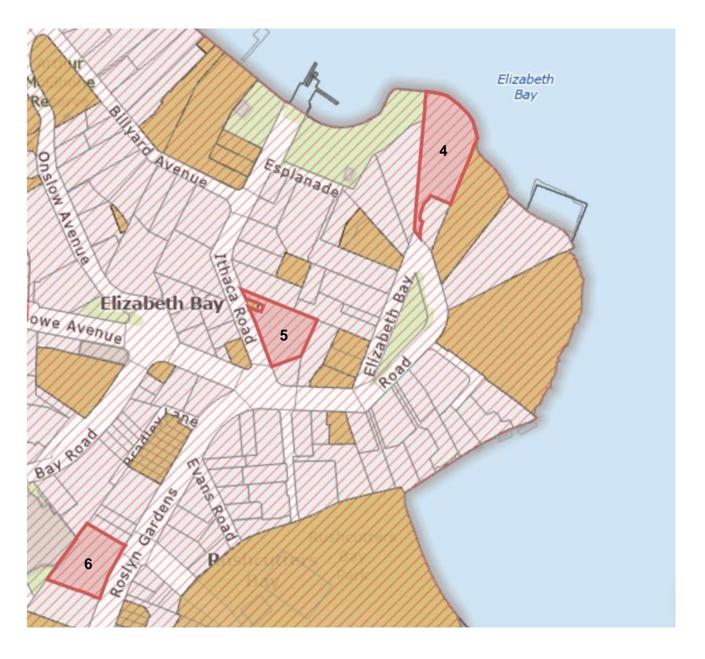
Figure 17. Extract from the SLEP 2012 Heritage Map (HER_022) showing heritage items adjacent to 108 Elizabeth Bay Road, Elizabeth Bay (4), 12 Ithaca Road, Elizabeth Bay (5) and 41-49 Roslyn Gardens, Elizabeth Bay (6).