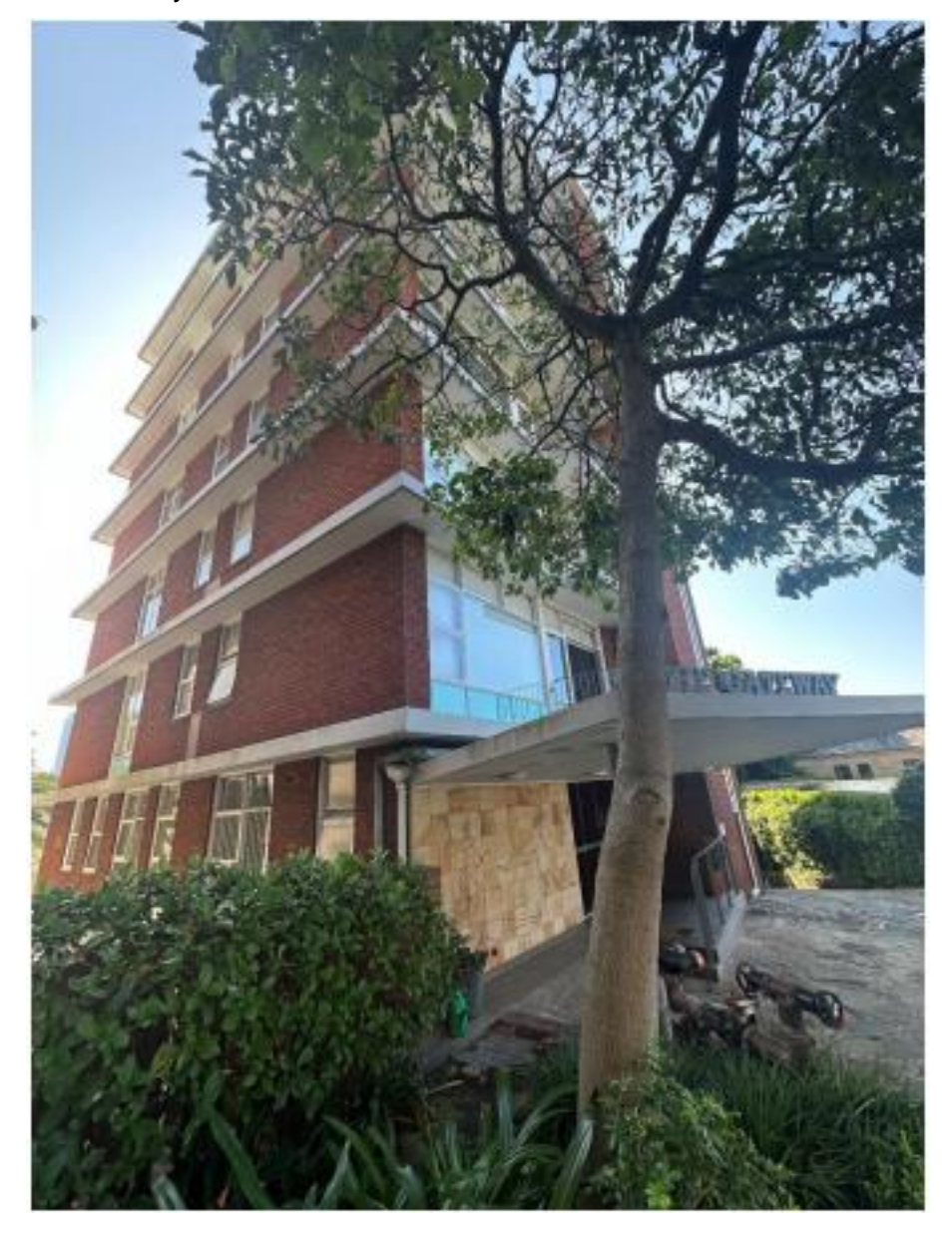
Figure 4. Gateway, 3 Wylde Street.

The Gateway flat building was designed by Douglas Forsyth Evans & Associates and constructed by Sydney Fischer (c.1959 – 1960). It is comprised of eight storeys: one parking level and seven residential floors with 35 units and 16 garages. Built with a steel frame using the lift-slab technique, it features projecting concrete slabs and a rhythmic pattern on the eastern elevation. The main entrance showcases a mural by sculptor Kurt Norden on a sandstone facade. Apartments are arranged to maximize light and views, with five units per floor, including two-bedroom and one-bedroom layouts.