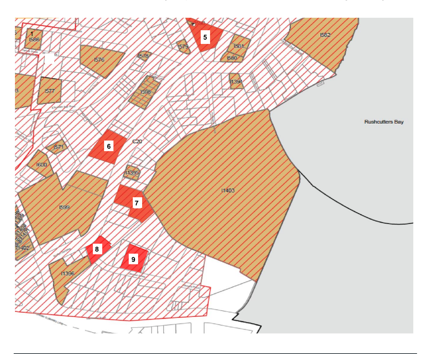
Figure 20. Proposed heritage boundary for 12 Ithaca Road, Elizabeth Bay (5) and 41-49 Roslyn Gardens, Elizabeth Bay (6), 50-58 Roslyn Gardens, Rushcutters Bay (7), 74-76 Roslyn Gardens, Rushcutters Bay (8) and 1-5 Clement Street, Rushcutters Bay (9) shaded in red in the SLEP 2012 Heritage Map tile HER_022.