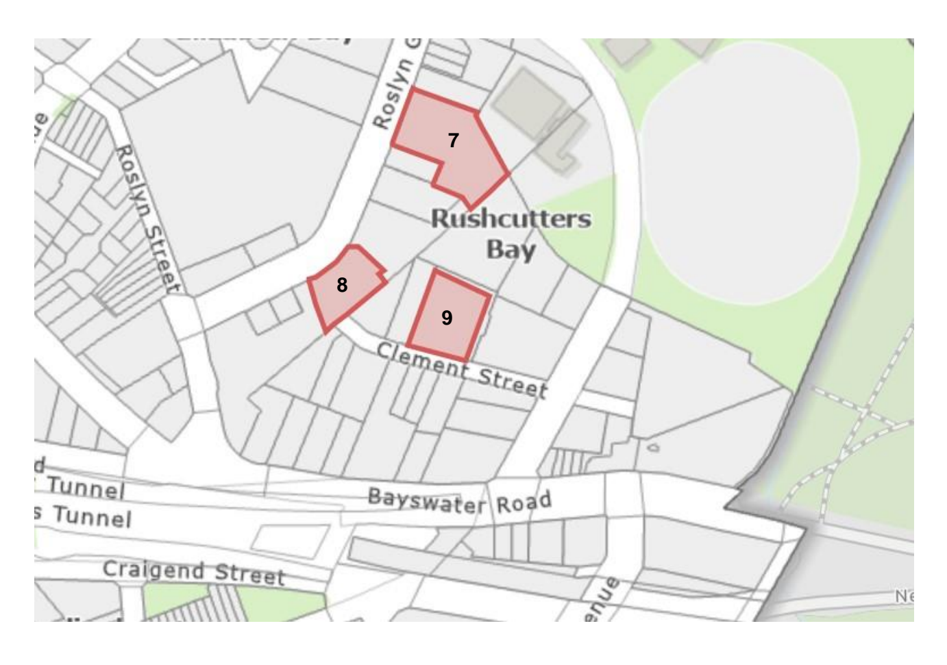
Figure 3. Location of 50-58 Roslyn Gardens, Rushcutters Bay (7), 74-76 Roslyn Gardens, Rushcutters Bay (8) and 1-5 Clement Street, Rushcutters Bay (9).