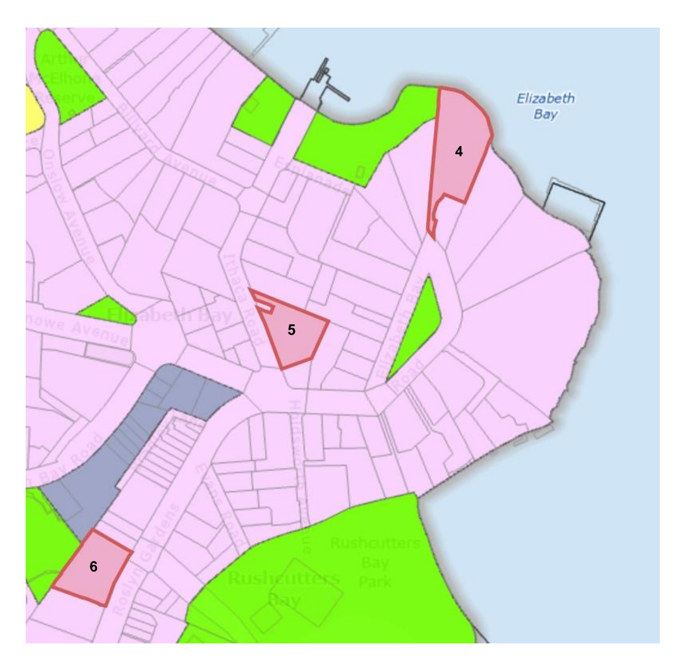
Figure 14. Extract from Zoning map in the SLEP 2012 showing zoning controls for 108 Elizabeth Bay Road, Elizabeth Bay (4), 12 Ithaca Road, Elizabeth Bay (5) and 41-49 Roslyn Gardens, Elizabeth Bay (6).